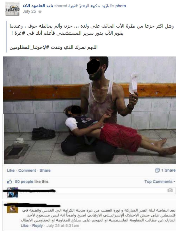
Figure 1. Screen shot of the post referring to the father holding his wounded son in the hospital.

Many posts and comments also featured central motifs involving religion, religious symbols, and evocations of God. Bab Al-Amud Al-A'n (admin) writes: