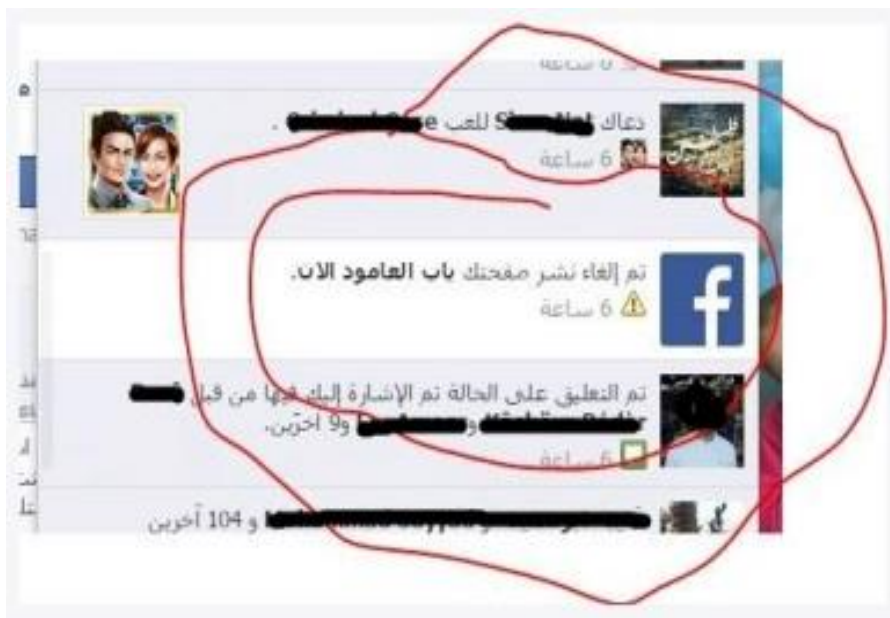
Figure 6. Screen shot of the message sent by Facebook on November 7, 2014, regarding the closing of the page Bab Al-Amud Al-A'n.

Because online networks are inevitably affected by the sociopolitical physical circumstances and by the power structures in which they are embedded (Aouragh, 2012; Dahlgren, 2013), the closing of this page may also reflect, to some extent, the offline structural sociopolitical circumstances of asymmetrical power relations and domination in which this page, and other similar pages, operate.