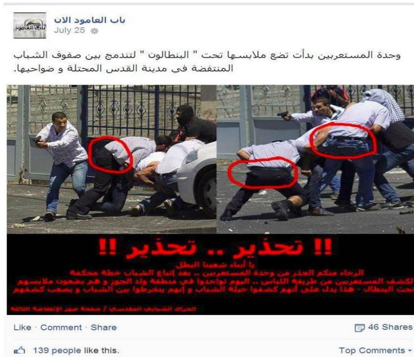
Figure 2. Screen shot of the post referring to the "mista'arvim" unit (unit of Israeli soldiers dressed like and posing as Arab civilians).

Maintaining engagement and performing connectedness through online participation were closely linked to attempts to mobilize national-civil protest.